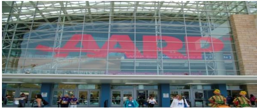
Front Lobby Windows / Ventanas sobre entrada Principal

The Signage Program is an additional new way to promote your activity, during the event at the Puerto Rico Convention Center. This is a first come, first serve option and it applies to any client renting space at the Facility. The prices established are based for the days of the event only. These do not include installation or dismantling fee. All signage needs to be removed during the Move Out. Client will be responsible to take measurements and submit design & type of materials to the Event Manager in charge subject to approval.