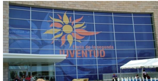
Side Doors/ Puertas Laterales