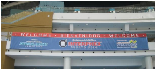
Mezzanine Railing/ Baranda del Mezzanine