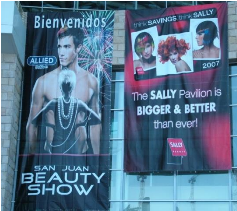
Terrace Banner/ Banner Terraza