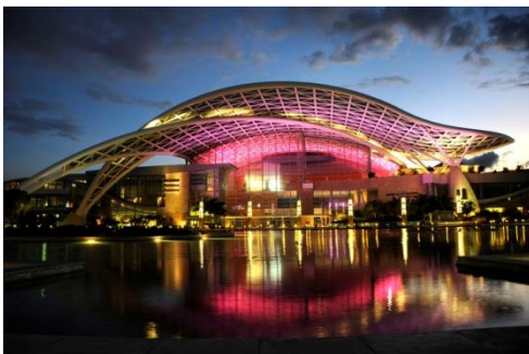
Paint the Building with Lights/ Pintar el Edificio con Luces